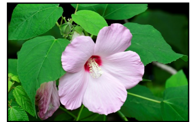
Swamp mallow Hibiscus moscheutos

The Bay County Conservancy is a land trust dedicated to the preservation of environmentally sensitive lands in Northwest Florida.